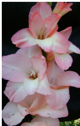
Gladiolous 'Sydney Percy Lancaster'