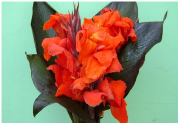
Canna generalis 'Raktima'

For induction of somatic mutation rhizomes of Canna cv. 'Cleopatra' was treated with various dose (10, 20, 30 Gy) of gamma rays (Cobalt 60) and growth parameters were observed. It was found that one mutant showed morphological changes (leaves from green to brown and flower from yellow-spotted to pure red). This mutant was isolated in pure form and later multiplied. The changed characters showed stability, uniformity and distinct from the parent.