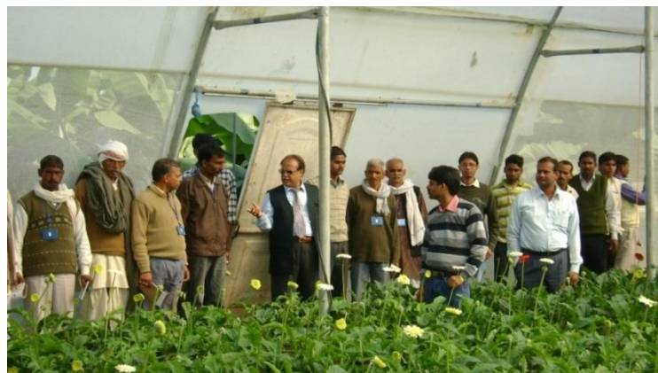
A view of field visit at village Dafedarpurva during Second Training Course