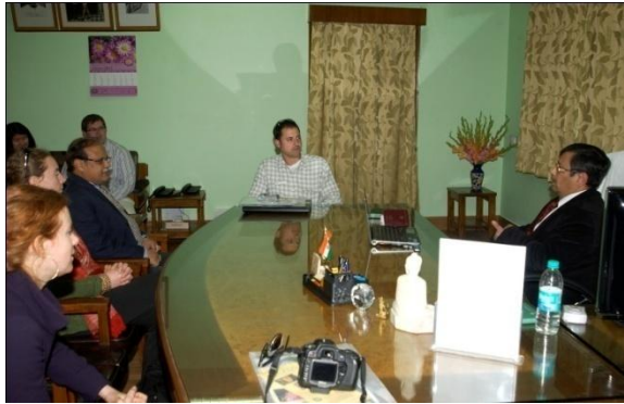
Director addressing the delegation from Longwood Botanic Gardens