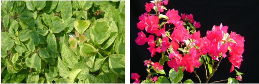
Bougainvillea 'Dr. P.V. Sane' in foliage & flowering

Bougainvillea lovers acclaimed the bract colour and variegated leaves of the new cultivar.